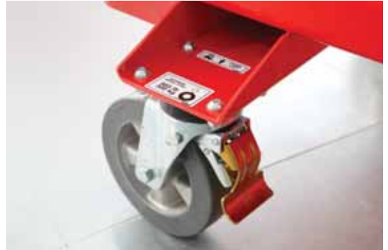
Heavy duty, non-marking castors