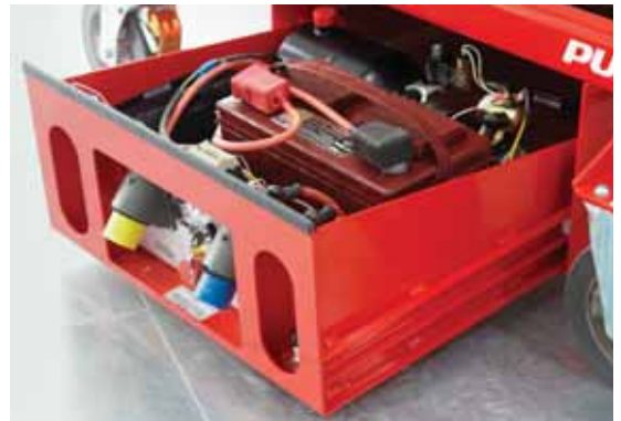
Slide-out service tray for easy maintenance