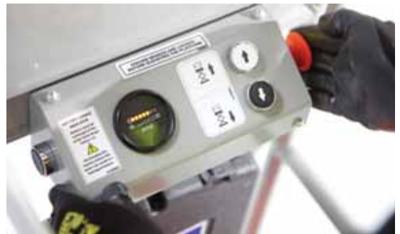
Simple, easy to operate push button controls