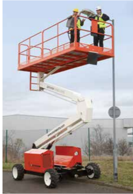
SL26SL/SL30SL SPEED LEVEL

Lightweight and compact, the S2770RT, S3370RT & S3970RT are ideal for outdoor work in confined spaces between buildings. With excellent ground clearance and an oscillating axle, they can tackle rough terrain with ease, and come with auto level outriggers and a 1.2m roll-out deck extension as standard.