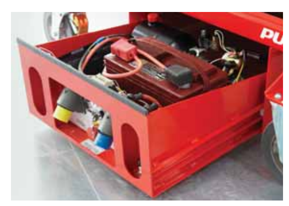
Slide-out service tray for easy maintenance