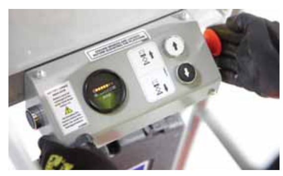
Simple, easy to operate push button controls